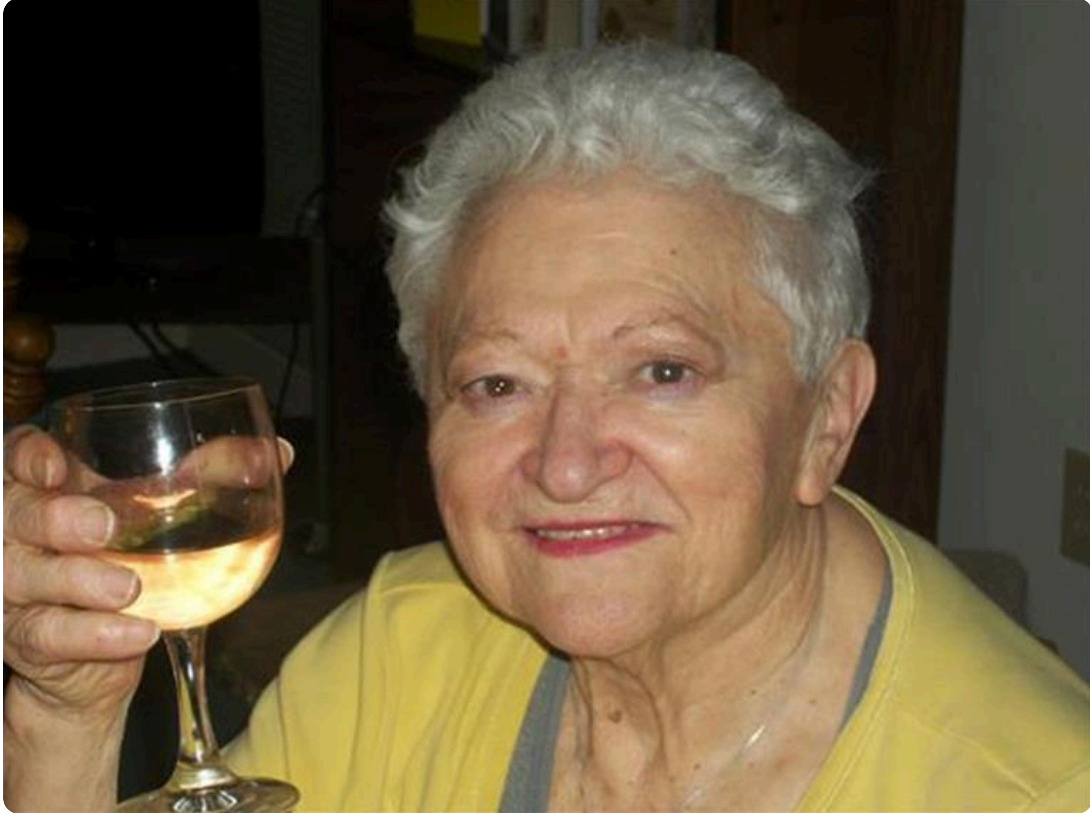
Lil enjoying a glass